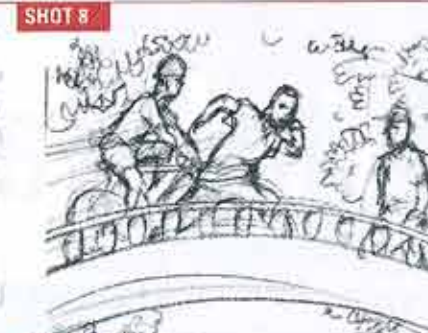
SHOT 8 Video WS – Bridge. Joe whips the cell phone from his pocket and dials while sprinting past a bicyclist.