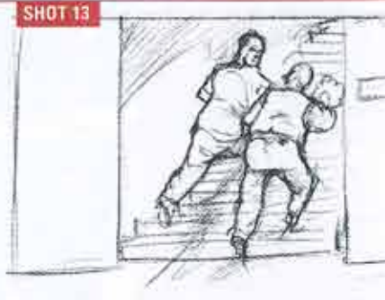
SHOT 13 Video MS – Joe and delivery person. He picks himself up, gets flowers from the delivery person. Angle widens as he rounds a corner and runs up stairs.