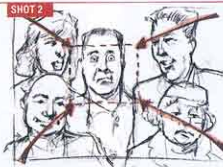
SHOT 2 Video MS – Passengers crammed inside elevator. At the center-rear: Average Joe. Two passengers are in front of him. ZOOM IN on his face to show panic. Audio Passenger 1: Is today the twelfth? (Joe nods in absentminded agreement) Passenger 2: (shakes her head) Thirteenth. Passenger 1: Are you sure? Passenger 2: Positive.