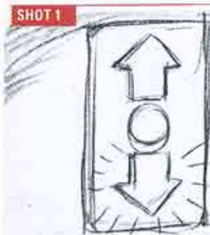
SHOT 1 Video CU – The “down” arrow. The elevator’s indicator light brightens. A bell chimes.