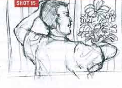
SHOT 15 Video Inside the room. You decide what happens next! Use one of our endings, or create your own. ■