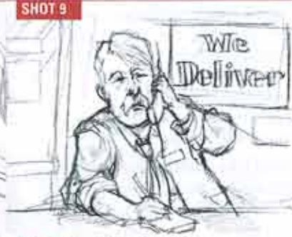
SHOT 9 Video MS – Delivery service. A clerk answers. Behind him a sign reads: “We Deliver.”