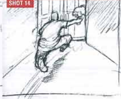
SHOT 14 Video MWS – Doorway. The heavy doors are closed. He makes an attempt to adjust his hair and clothes, takes a deep breath and opens the door.