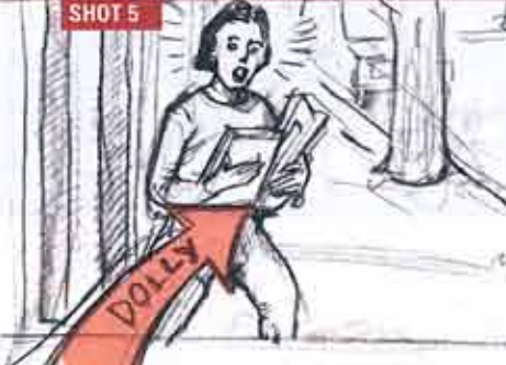
SHOT 5 Video WS – A cute college girl. Camera zooms in quickly as she steps out of a doorway. She glances over, throws up her arms and screams.