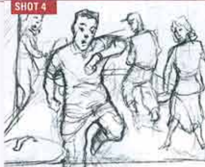
SHOT 4 Video XWS – City street. Joe sprints down the street. He hurdles a baby carriage, glances at his watch, dodges a trash can.